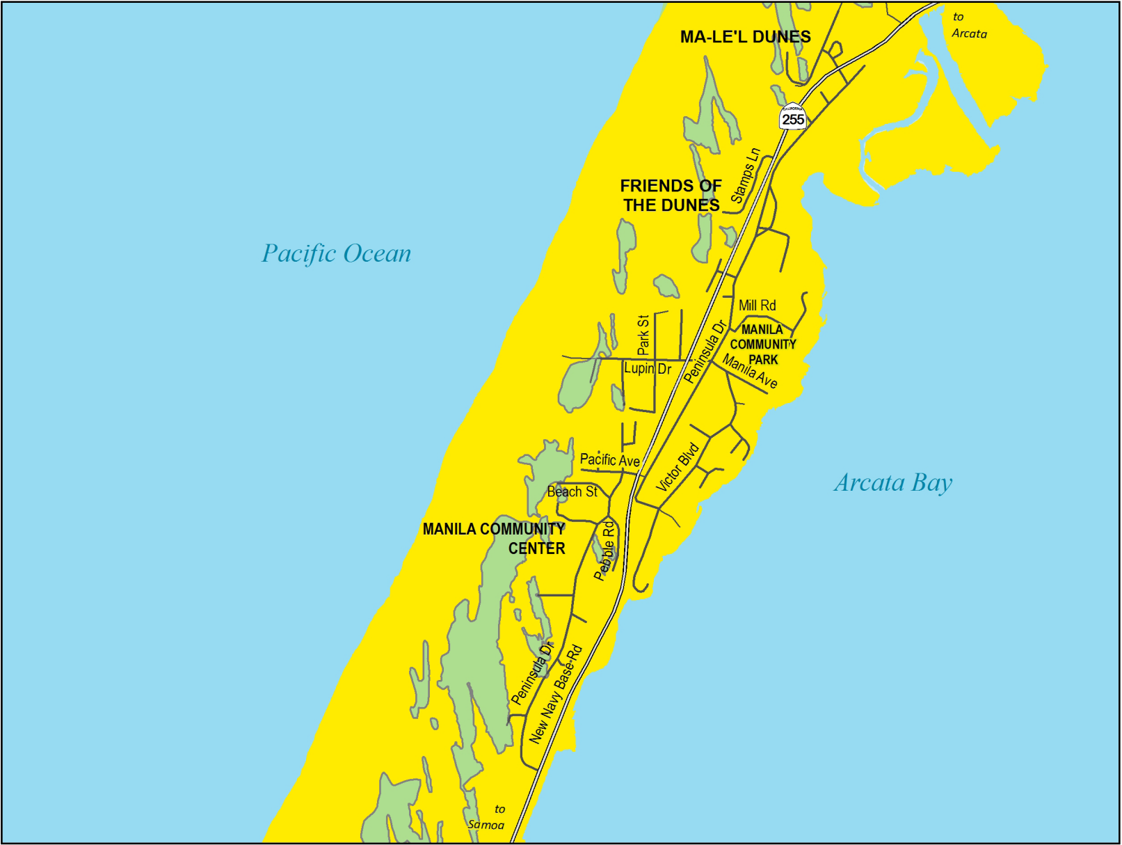
MANILA Tsunami Hazard Map