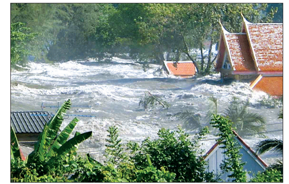
2004–THAILAND When the water rushed in, it looked like a river in flood.