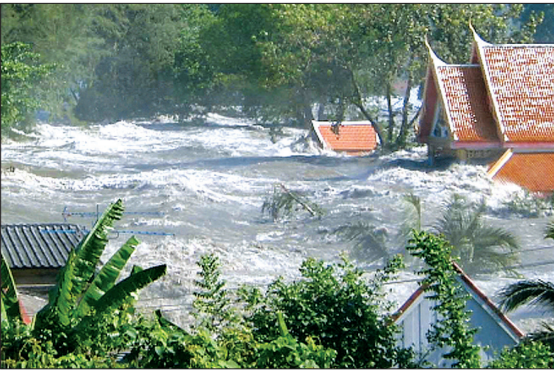
2004–THAILAND When the water rushed in, it looked like a river in flood.