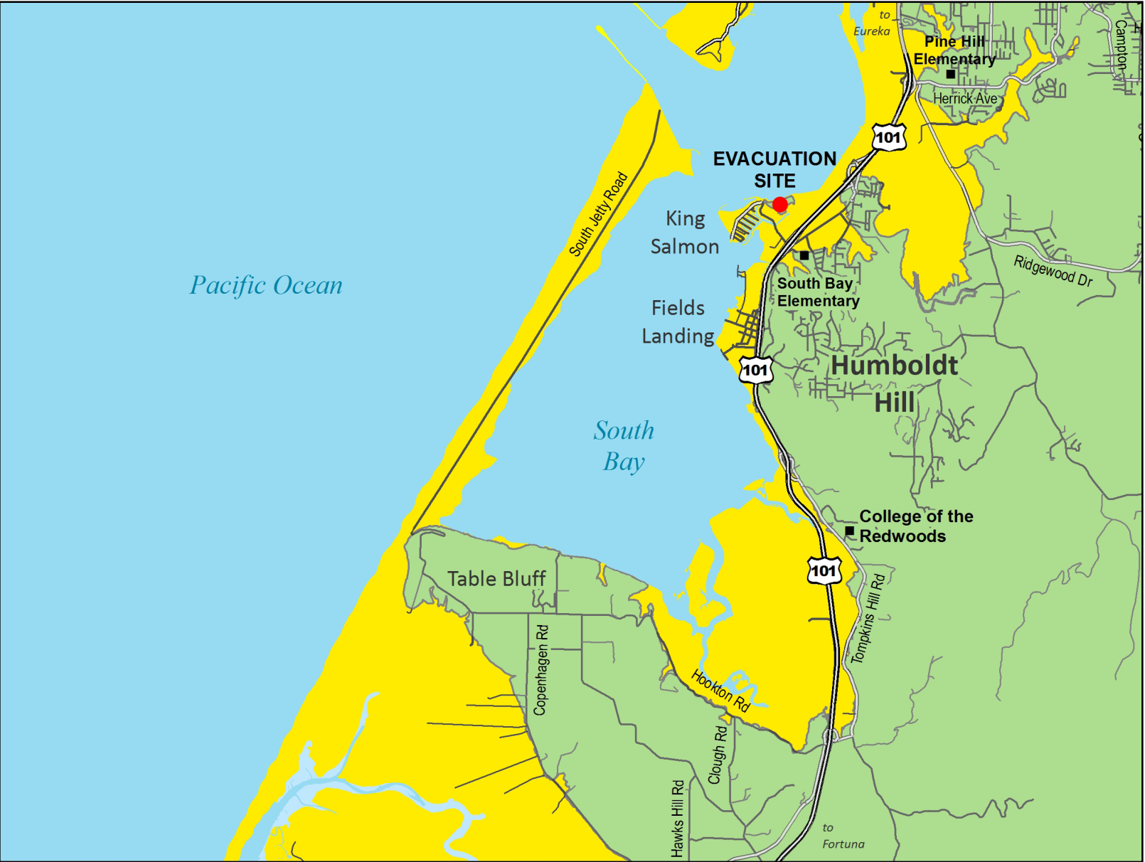
SOUTH BAY Tsunami Hazard Map