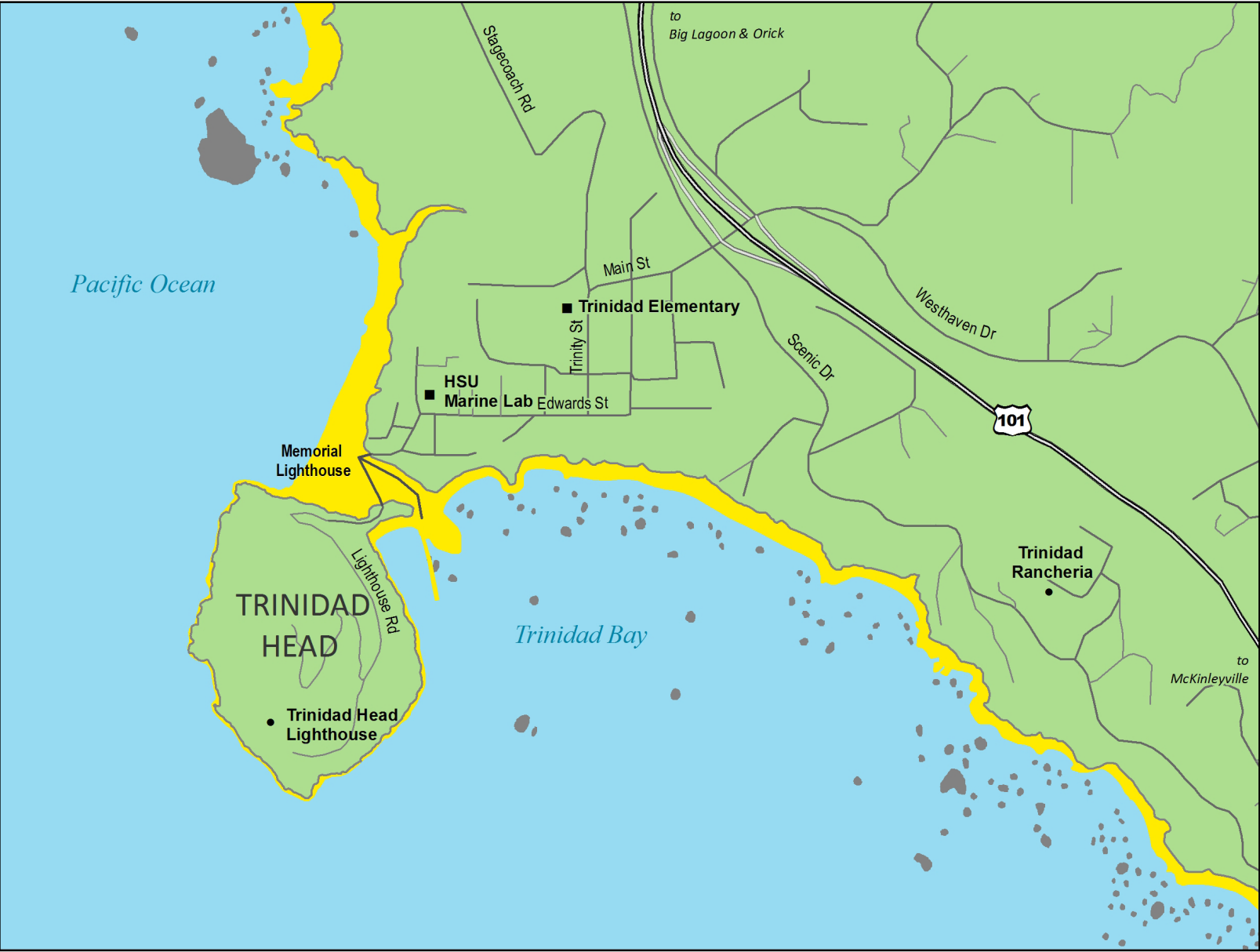
TRINIDAD Tsunami Hazard Map