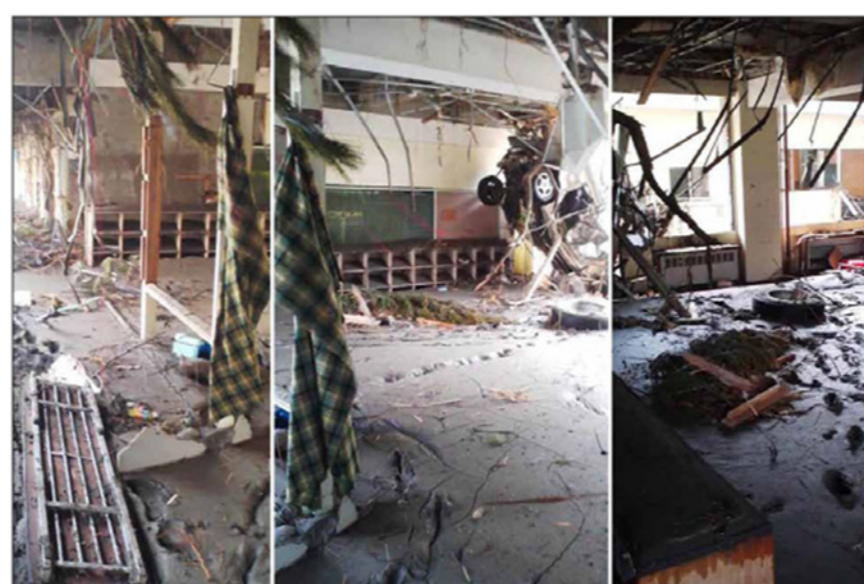
Debris from the tsunami, including a car, litters the third floor of the Kamaishi Junior High School.