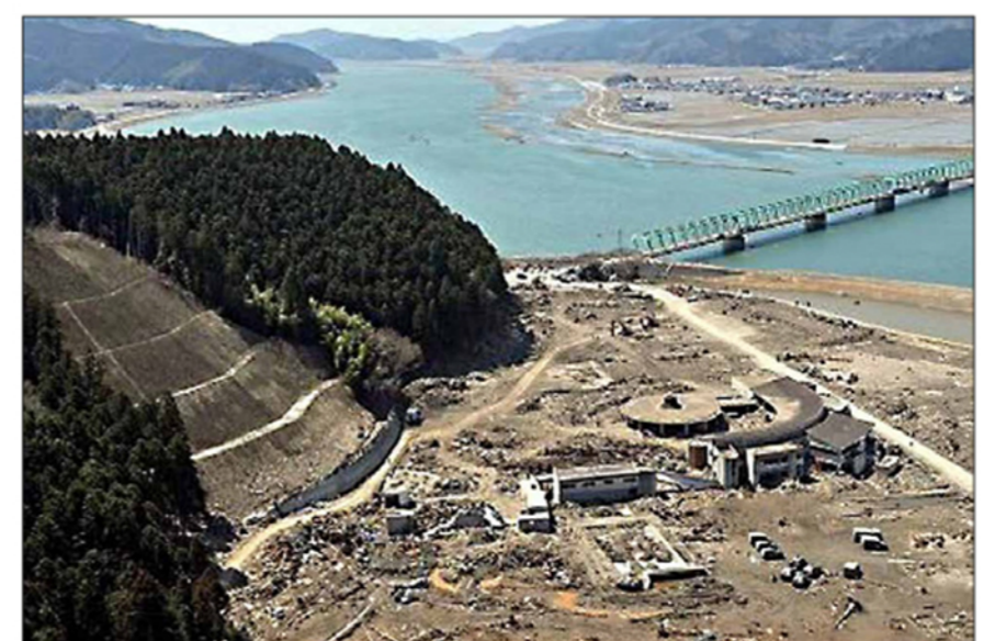
Students and staff at Okawa Elementary School weren't so lucky. The school had no tsunami plan and did not practice evacuation drills. Even though high ground was very close, 74 students and ten teachers died.