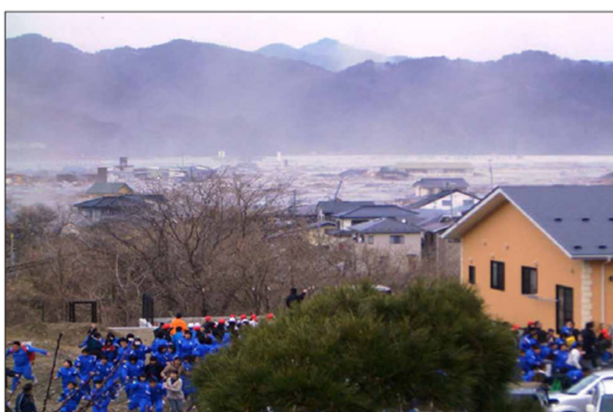
Students run to high ground while the tsunami attacks Kamaishi.