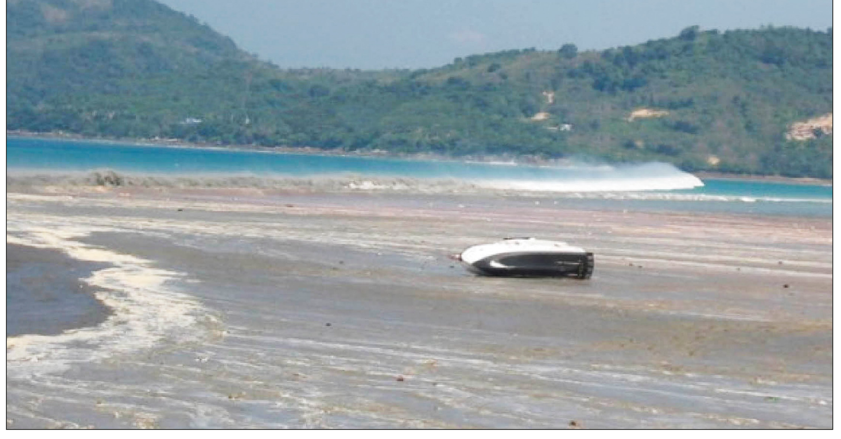
2004-THAILAND When the water rushed in, it looked like a river in flood.

2004-THAILAND In Phuket, the tsunami began as a withdrawal of the ocean water that exposed hundreds of feet of the sea floor.